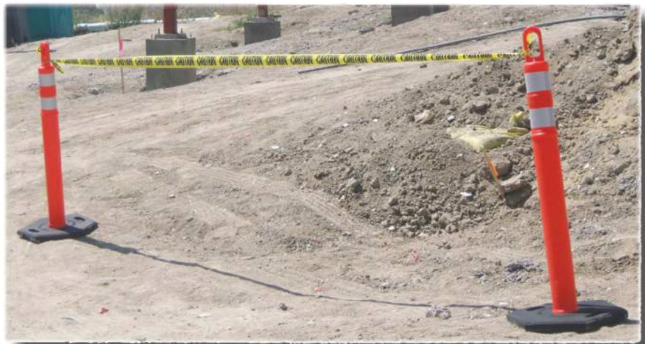
Closing off an area of the job site is quick and easy utilizing the unique "loop" style handle with two or more Looper Tubes tied together with caution tape, flag line or rope.