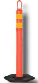
Looper Tube with (2) 3" bands of yellow reflective tape