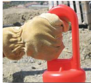
Looper Tubes unique "loop" style handle makes grabbing and moving a breeze