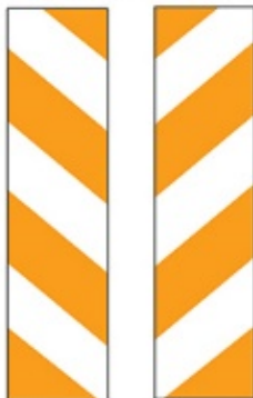
Left Hand Vertical Panel Right Hand Vertical Panel